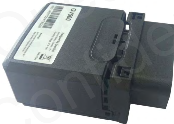
Figure 3. Opening the Case