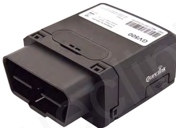
Figure 1. Appearance of GV500

GV500 is based on the OBD II interface GPS vehicle tracking device, compact design and easy to install. GV500 contains an OBD II connector which complies with J1962 standard, a 10PIN USB connector, an internal GSM antenna, an internal GPS antenna and three LEDs.