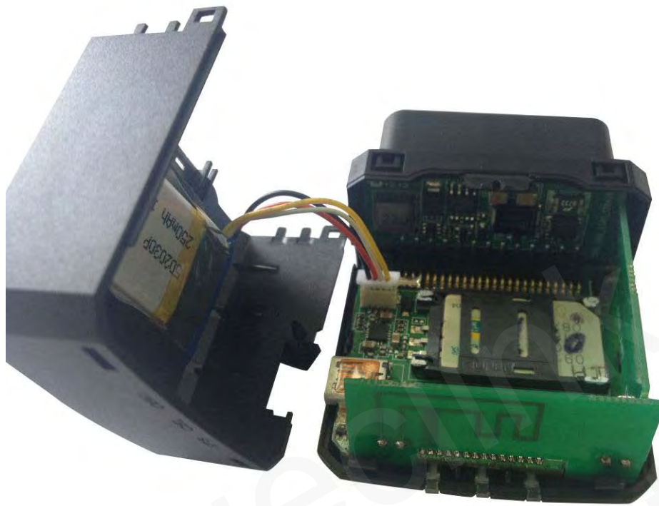
Figure 6. Backup Battery Installation

There is an internal backup Li-ion battery.