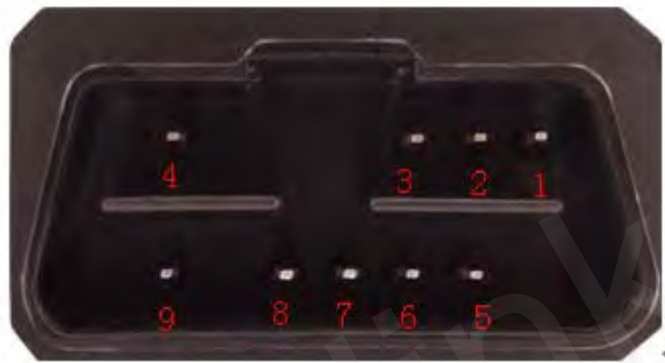
Figure 2. The OBD II connector on the GV500

The GV500 has an OBD II connector. It contains power supply and interfaces of CAN bus, K-line, L-line and J1850 bus. The sequence and definition of the OBD II connector are shown in following figure: