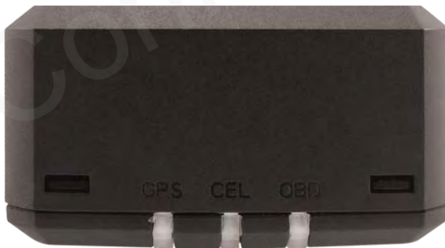
Figure 7. GV500 LED on the Case