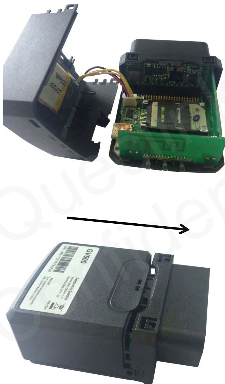
Figure 4. Closing the Case

The battery is glued to top cover, so before closing the case you should let the battery connector plugged in. The step of closing case is shown as following: