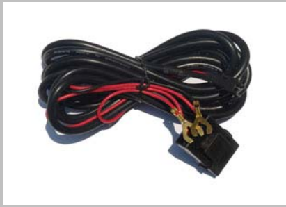
Battery cables (standard)